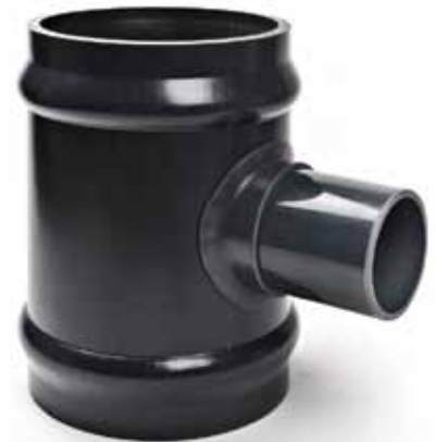
Reduced Tee big diameters