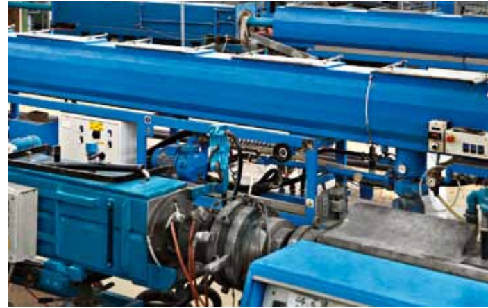
Extrusion line view