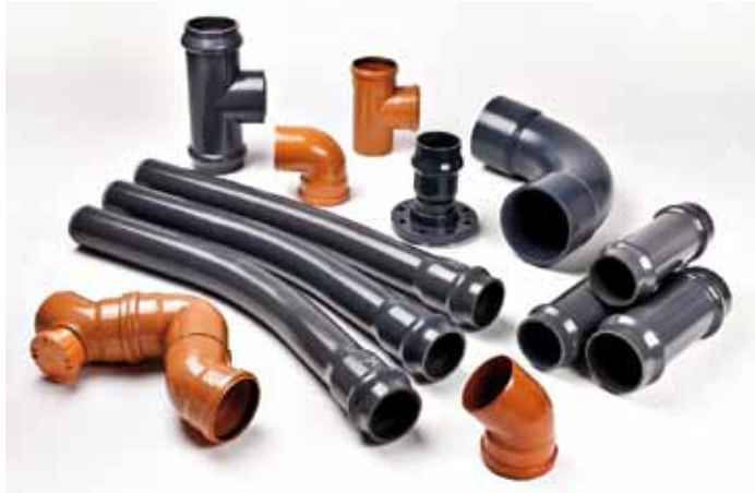
PVC Pressure and Sewage fittings