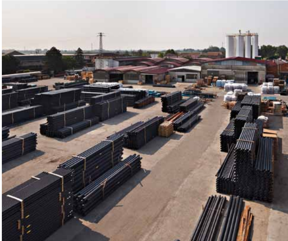
Partial view of our PVC pressure pipes stock