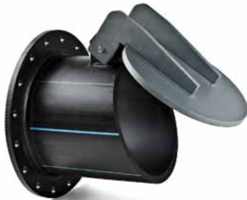
PVC/PE Clapet Valve