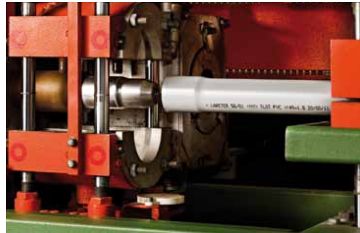
Details of the thermoforming process of the joint