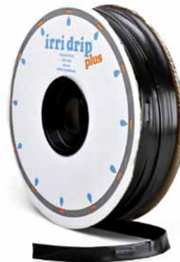
Irridrip - light dripping device