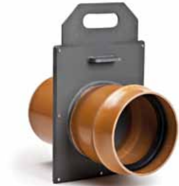
PVC Guillottine Valve